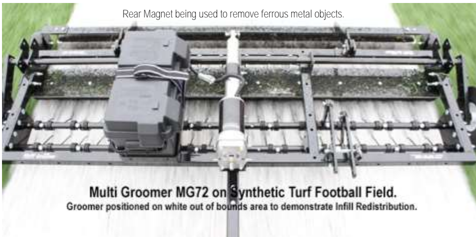
Rear Magnet being used to remove ferrous metal objects.

Periodic maintenance of Synthetic Turf requires a grooming machine that will stand up turf fibers while also redistributing infill. This grooming makes the turf feel softer, provides the optimal athletic playing surface, and prolongs turf life.