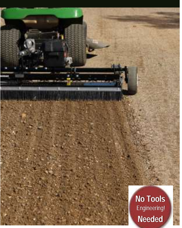
"We Make Dirt & Turf Look Good"

Warranty (in a nutshell): Heying Company machines carry the following warranty on parts and workmanship, to be free of defects, under normal and intended use and service conditions, of: Three (3) years parts and workmanship on Heying Company manufactured parts. One (1) Year on parts not manufactured by Heying Company, including but not limited to: Wheels, brushes, electrical cylinder (actuator), electric system parts, wireless remote control systems, switches, batteries, chargers, etc. Excluded is this warranty is Normal Wear and Tear on Parts resulting from natural and intended use.